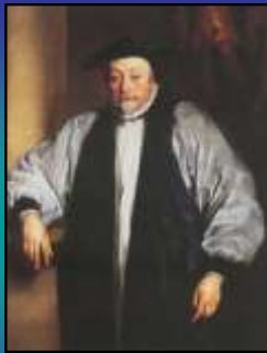
William Laud: (1573-1645)

Head of the Church of England, and supported the Divine Right of Kings. He said also that the church was, (naturally) the right hand of the King.