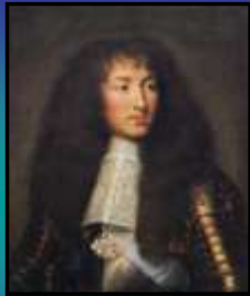
Louis XIV: (1643-1715)

Therefore they were only answerable to god (not to the people). He was the most powerful ruler of his time.