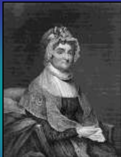
Abigail Adams: (1744-1818)

She frequently made suggestions about the new government's formation.