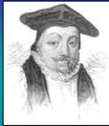
William Laud: (1573-1645)

So the King and the Church should work together. He severely punished those that didn't support his church.