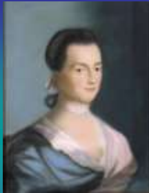
Abigail Adams: (1744-1818)

Wrote letters to her husband (John Adams) urging Colonial Independence. Reminded John not to forget about women's rights in the new United States.