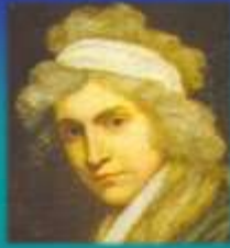
Mary Wollstonecraft: (1759-1797)

She said that women's inferiority was not natural but was rather a consequence of their mis-education, a mis-education imposed on them by men.