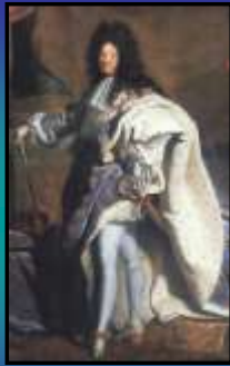
Louis XIV: (1643-1715)

Ruled France as an absolute monarch. He believed in the Divine Right of Kings, and that kings received their authority from god.