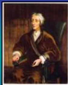
John Locke: (1632-1704)

Thought governments should happen with the support of people. Argued that governments should be established to protect the individual freedoms and liberties.