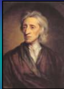
John Locke: (1632-1704)

English philosopher who believed that people had the ability to reason, and make good decisions when given the proper information.